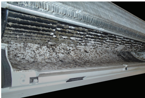
Mold thrives on mini-split blower wheels